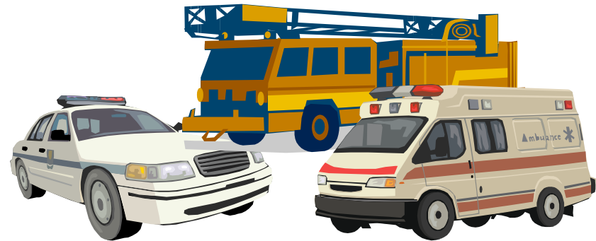
Multi-Agency Response Initiated