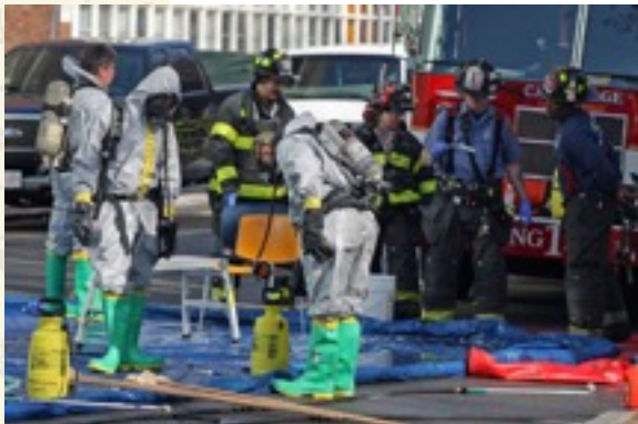
Major Event - Incident Command Initiated