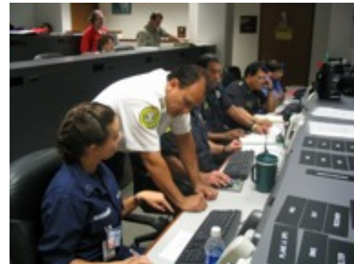
City EOC Activated